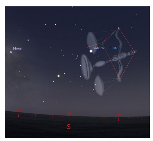
Saturn in the constellation Libra

Website <a href="www.ThanetAstronomyGroup.com">www.ThanetAstronomyGroup@gmail.com</a> Email <a href="mailto:ThanetAstronomyGroup@gmail.com">ThanetAstronomyGroup@gmail.com</a> Or come and see us at our free informal public pop in meeting. At the West Bay Cafe, Sea Road, Westgate-on-Sea. CT8 8QA. Saturdays 1-4pm.